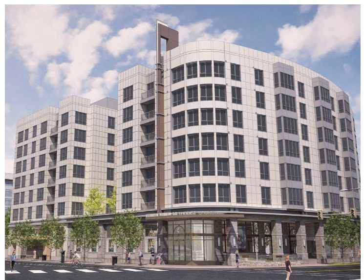
Rendering by DCS Design