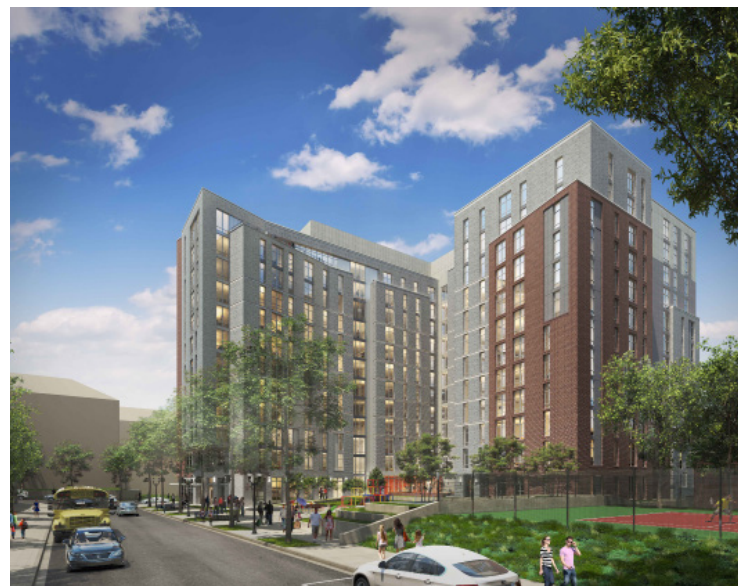
Queens Court and public space. Rendering by KGD Architecture.