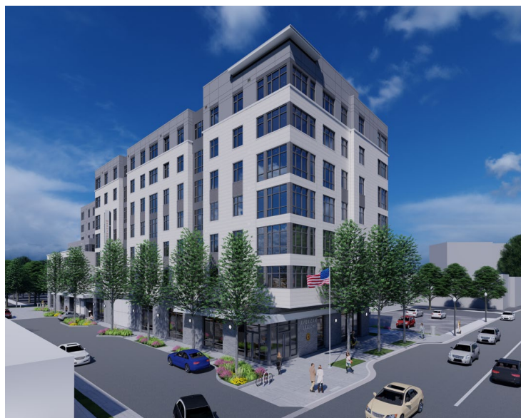
Early Rendering by DCS Design