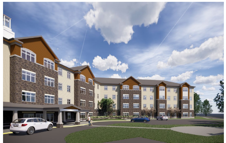
Early Renderings by Grimm + Parker