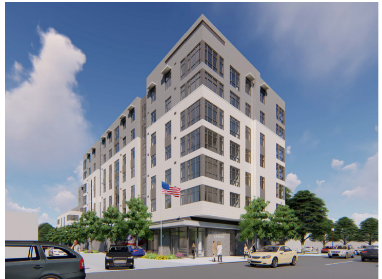
Early Rendering by DCS Design