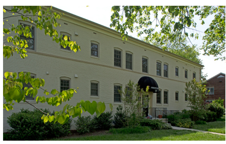
Fisher House I & II Apartment Mix and Affordability