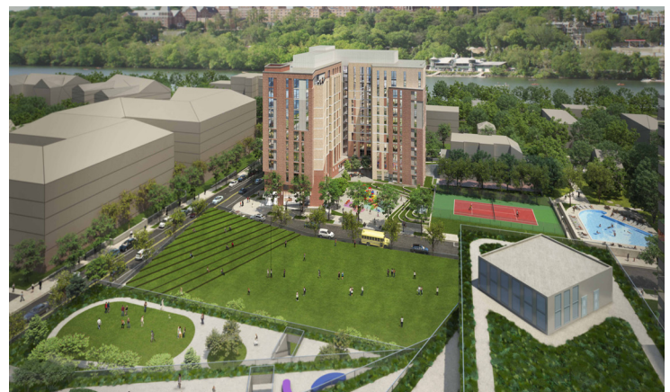
Redeveloped Queens Court and public space. Rendering by KGD Architecture.