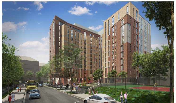
Redeveloped Queens Court. Rendering by KGD Architecture.