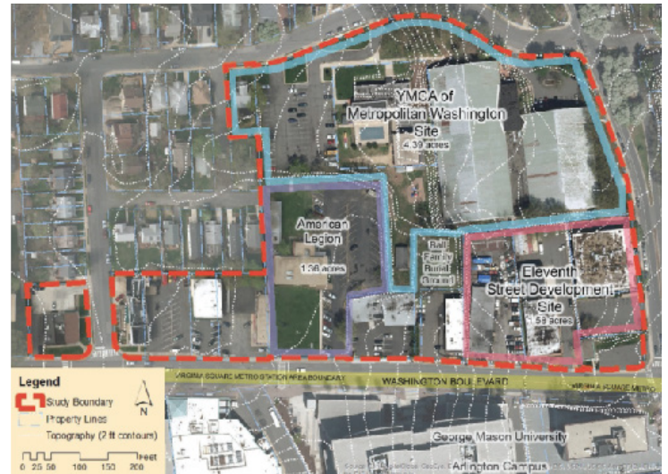
Arlington County Special Land Use Study

American Legion Post 139 LISC - National Equity Fund Arlington County A-SPAN