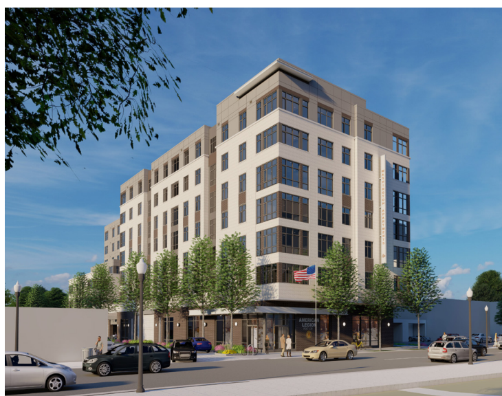
Rendering by DCS Design